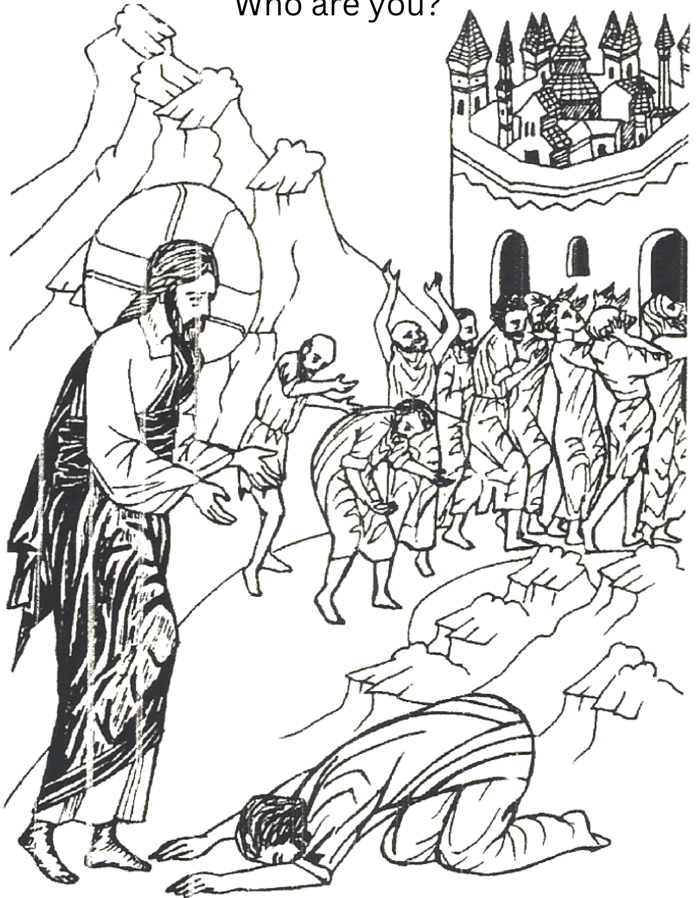
THE TEN LEPERS